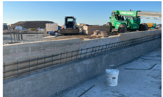
Lap pool gutter wall rebar being installed and forms set