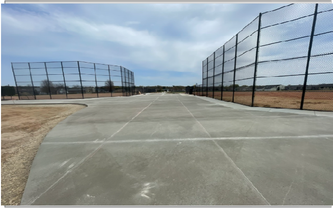
Concrete paving between ballfields