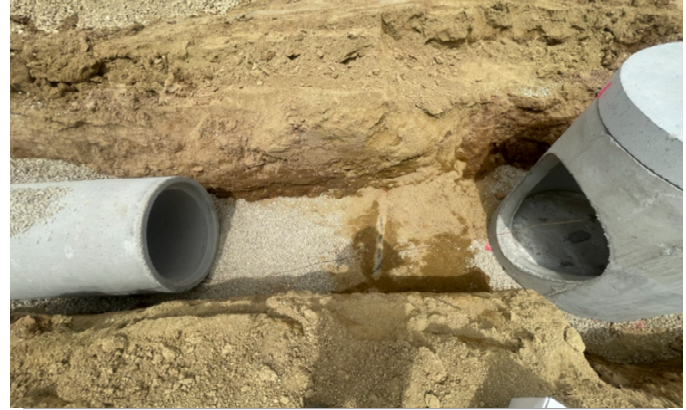
Picture of water main conflict with storm off windmill ridge