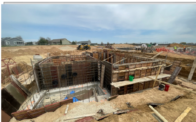
View of wall rebar and forms being set @ equipment building