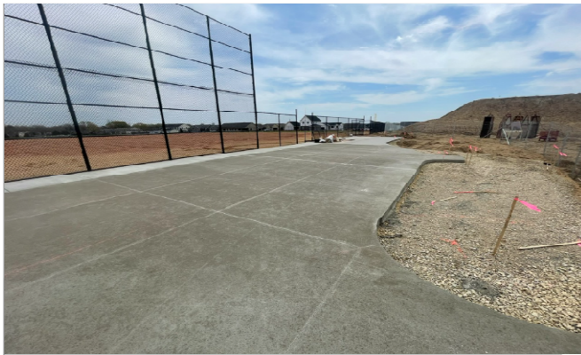
Concrete paving poured around baseball field