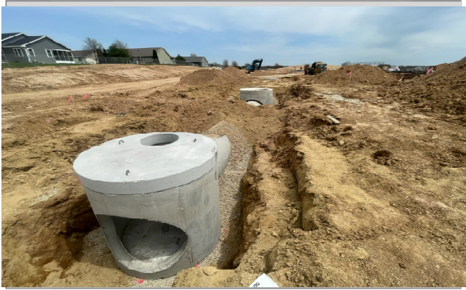
Storm run being set in North parking lot