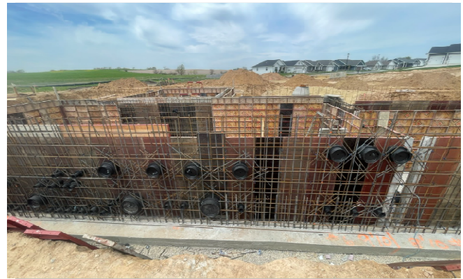
Wall sleeves set in equipment building South wall and rebar being installed