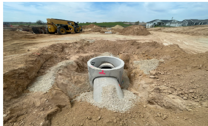
Storm pipe and structures being set