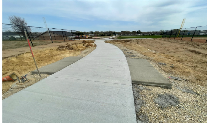
Bench pads poured