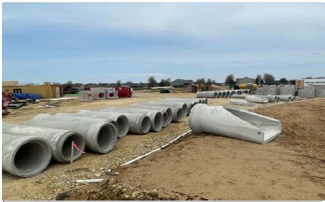
Storm RCP delivered and staged